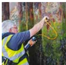
Marine Asset Inspection