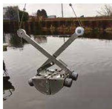
Environmental Survey & Sampling