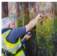
Marine Asset Inspection